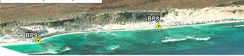
Gnaraloo Bay Rookery - North