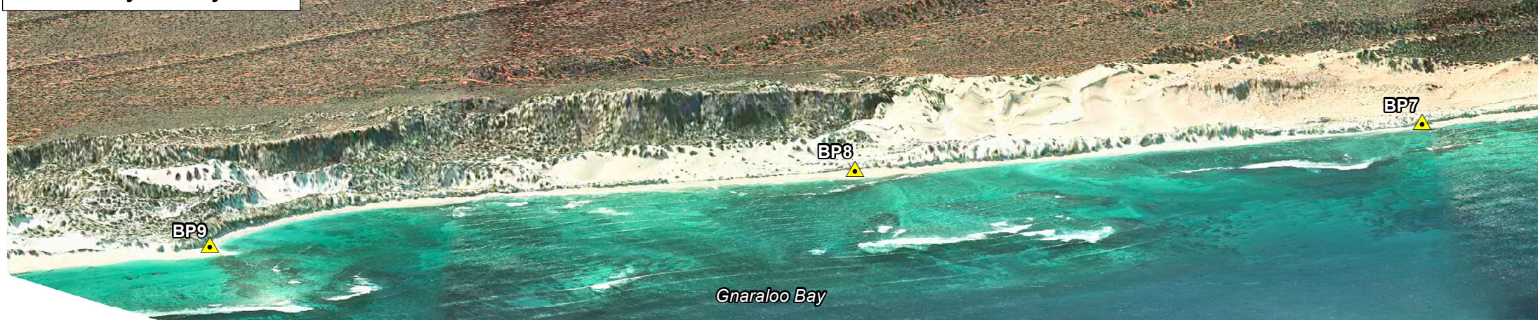
Gnaraloo Bay Rookery - North