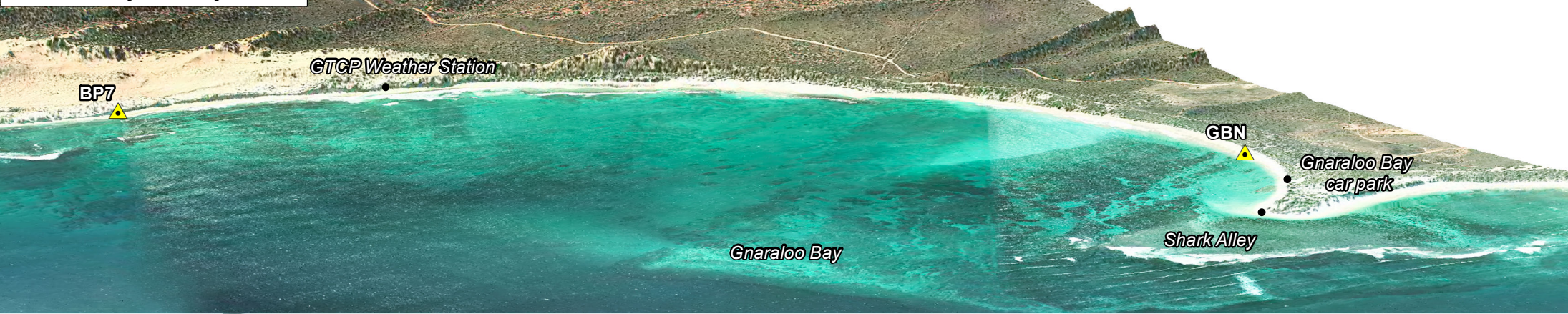
Gnaraloo Bay Rookery - South