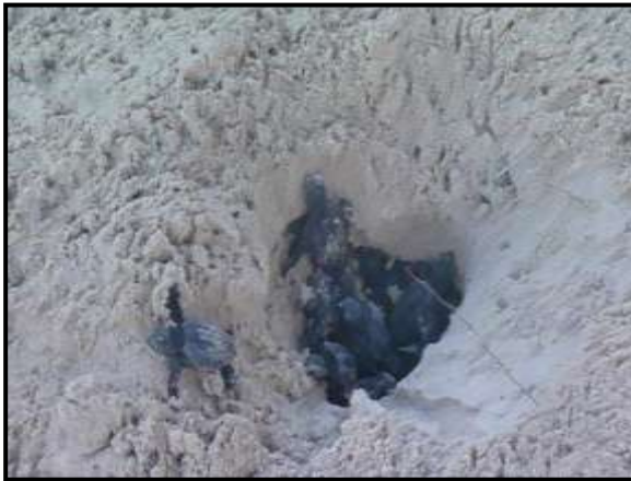
Photo 11: Loggerhead ( Caretta caretta ) hatchling boil at GBR, 2011/12