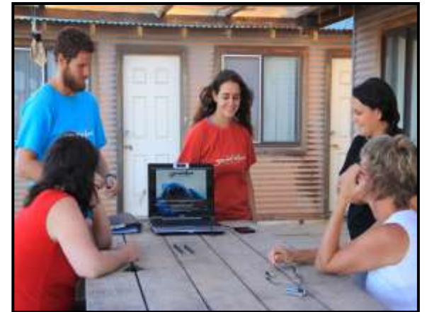
Photo 27: GTCP field team with community volunteers at Gnaraloo prior to morning patrol, 2011/12