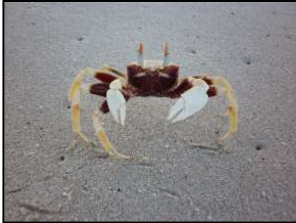
Photo 19: Running ghost crab ( Ocypode ceratophthalma ) at GBR, 2011/12