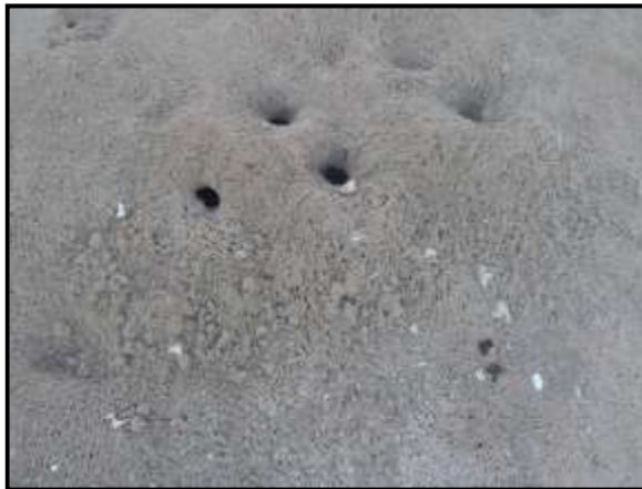
Photo 17: Crab predation of nest at GBR, 2011/12 (note egg shell remnants)