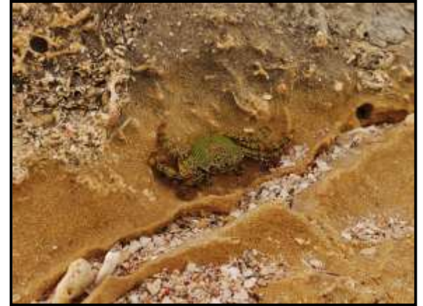
Photo 20: Tropical shore crab ( Grapsus albolineatus ) at GBR, 2011/12