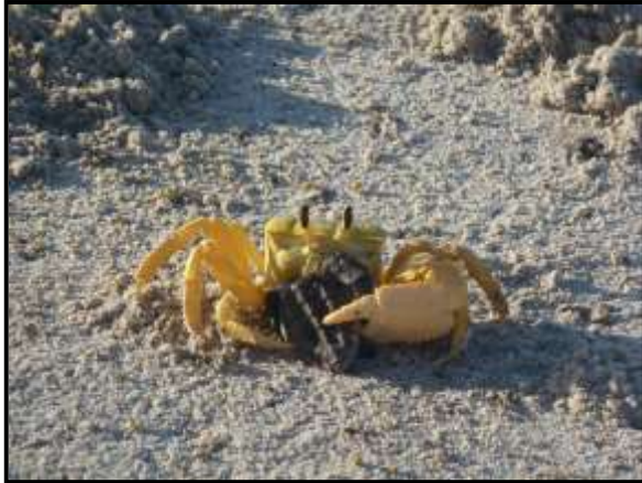
Photo 18: Golden ghost crab ( Ocypode convexa ) with loggerhead hatchling at GBR, 2011/12