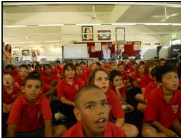
Photo 26: GTCP presentation to East Carnarvon Primary, 2011/12