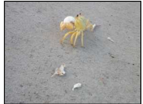
Photo 18: Golden ghost crab ( Ocypode convexa ) with turtle egg at GBR, 2011/12